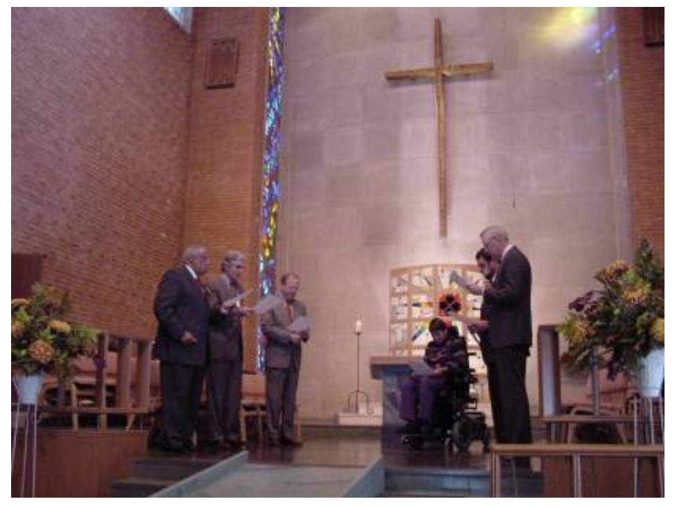
New members of the Board of Governors are installed during a chapel service.

but we are one of the best kept secrets in Washington and an untapped resource in Ward 3.